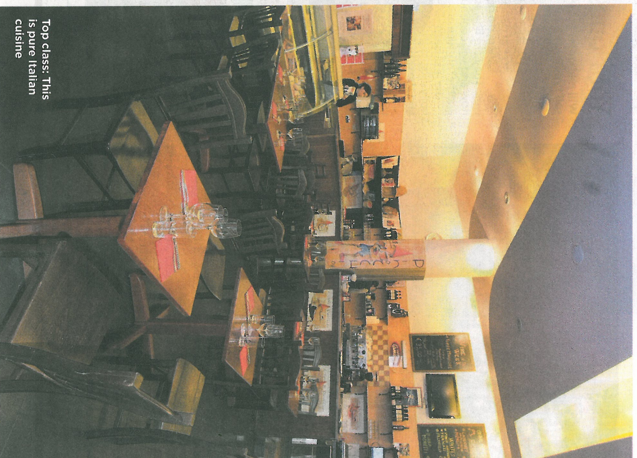
Top class: This is pure Italian cuisine

Also, from this table, you get a view into